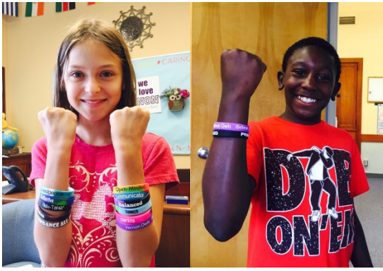
Vernon Owls IBelieve. IBelong. IBecome.

We have lots of fun new initiatives this year to help our students grow and develop as IB learners and leaders. One of the more popular is the IB Learner Profile bracelets. Students can earn bracelets for each of the 10 IB Learner Profiles by receiving Compliments or teacher awards. They can also earn bracelets for attendance. All students already received a purple Vernon Owls bracelet with our student mission: IBelieve. IBelong. IBecome, and many have already earned Compliments and are well on their way. This year, we will also have quarterly awards ceremonies and Specials (Art, Music, PE, Mandarin, Library) awards. Also, ask your kiddo about the Vernon Diner Olympics in the Café. Come grow with us!